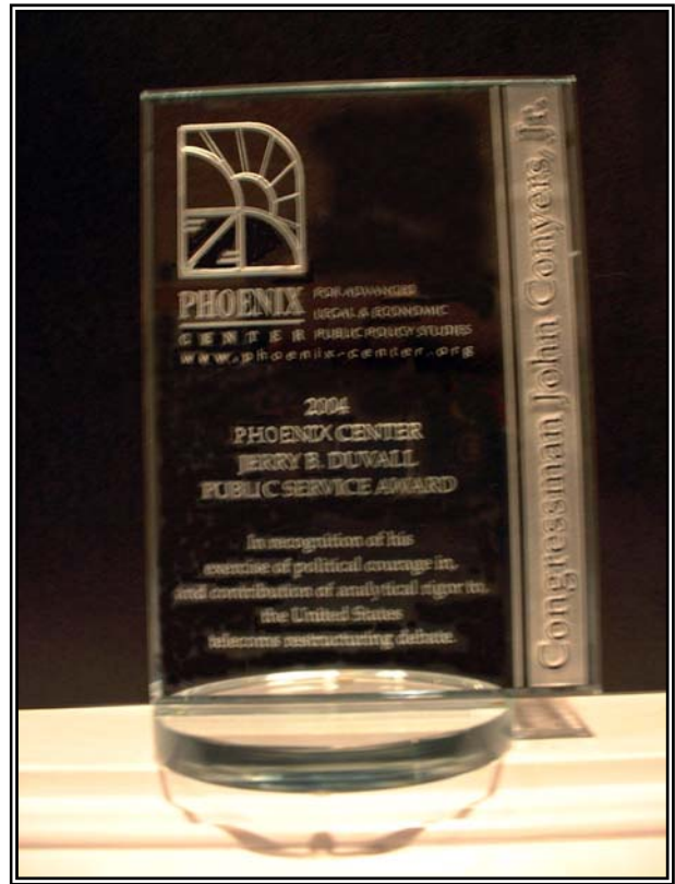
The Duvall Award